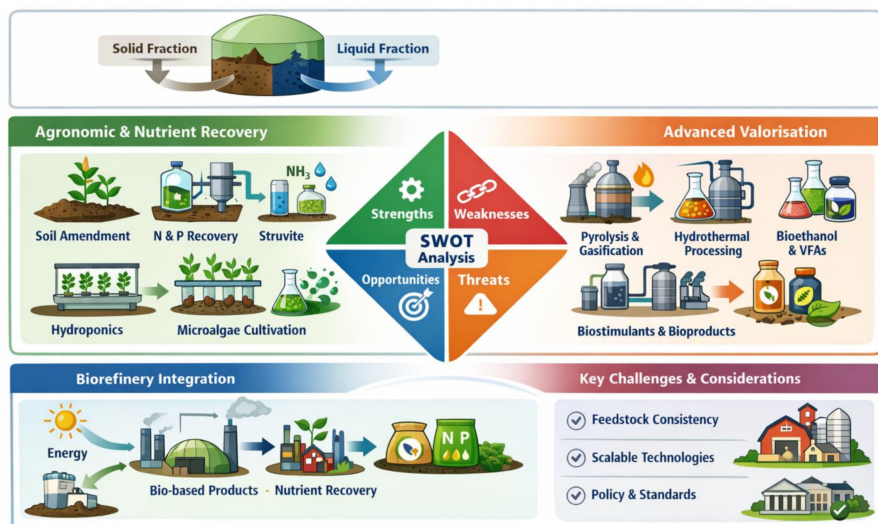
Fig. 1. Valorization strategies and challenges for manure-based digestate.

Manure-based digestate constitutes a valuable secondary resource within circular bioeconomy systems. Instead of being regarded solely as a waste by-product, digestate can be valorized through multiple pathways, including nutrient recovery technologies for agronomic use , thermochemical conversion , and a range of biochemical and biotechnological processes . In addition, it shows potential for material reuse and as a low-cost growth medium for plants, microalgae, bacteria, and fungi. This study presents a comprehensive assessment of the strengths, weaknesses, opportunities, and threats (SWOT) associated with various manure-based digestate valorization strategies.