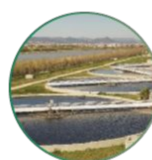
CSI: Aigües de Barcelona, Barcelona, Spain