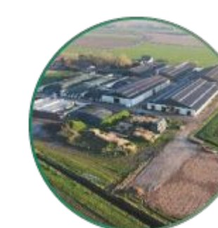
CS3: De Zwanebloem, Adinkerke, Belgium