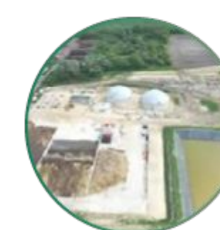
CS2: Bourges, France