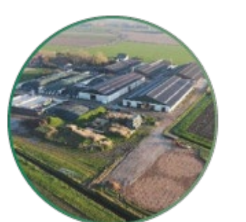
CS3: De Zwanebloem, Adinkerke, Belgium