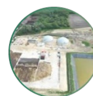
CS2: Bourges, France