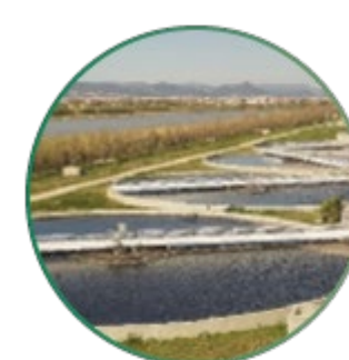
CS1: Aigües de Barcelona, Barcelona, Spain